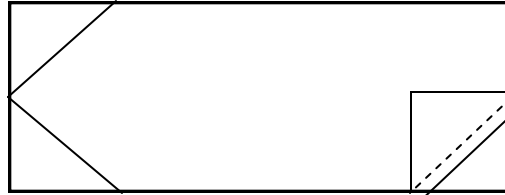
Repeat for remaining corners: stitch , cut press outward.

Repeat until all four corners have been trimmed with a Gold scrap square. Make 20 sashing units with all four corners trimmed as in the diagram below. Set aside the remaining 18 un-trimmed sashing strips to use later in the project.