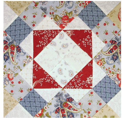
12-inch square finished (12 1/2-inch unfinished )

On the night of April 17th, 1790, wrought with fever, Benjamin Franklin rested in his bed on Market Street. Recently he had been working on his autobiography and kept up with a little letter writing. Life had been good to this hard working man! With his grandsons at his side, he quietly slipped into eternal peace. Franklin's funeral was the largest Philadelphia had ever seen...he is buried beside his wife in the northwest corner of Christ Church Cemetery...a few blocks from home.