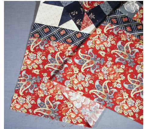
(Close-up showing top and bottom pieced borders)

This step will finish the top, bottom, and side borders of the Non-Traditional Setting for the Benjamin Franklin Mystery Quilt and finish the construction instructions. Photos of both the Traditional and Non-Traditional quilts as well as the remaining pages of the instructions will be post very soon.