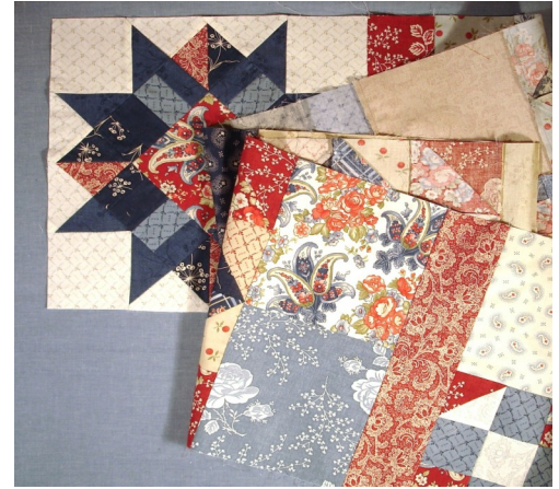
12 1/2 x 94 1/2-inches (row)

This step will begin the finishing Non-Traditional Setting for the quilt. We will offer the finishing steps broken down into sewing steps, much like the blocks, so that those who are working on the quilt as it posts may continue to follow along while continuing to finish their quilt. There are very few steps in this setting.