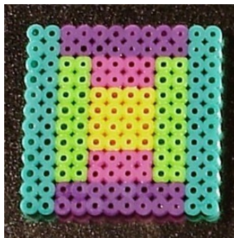
Courthouse Steps Block

Red (16) Blue (16) Blush (32) Kiwi Lime (32) Pastel Lavender (48) Total-144