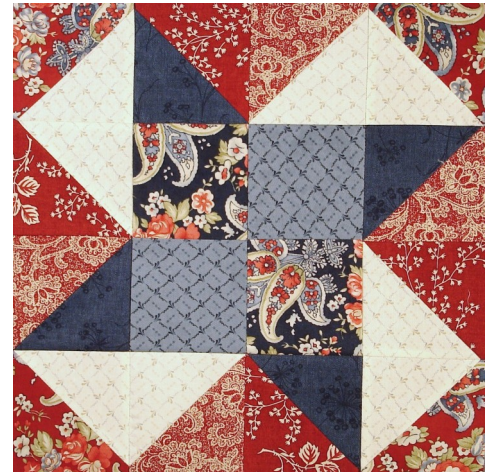
12-inch square finished (12 1/2-inch unfinished)