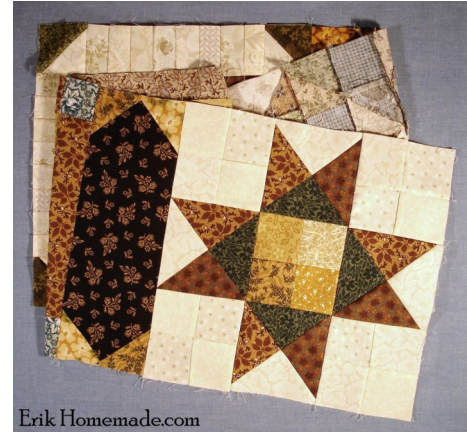
Row measures 12 1/2 by 60 1/2-inches

This step will continue the assembly of the center field of the 'Traditional Setting' quilt. We will offer the finishing steps broken down into sewing steps, much like the blocks, so that those who are working on the quilt as it posts may continue to follow along while continuing to finish their quilt. After all of the steps have finished posting for the 'Traditional Setting', the 'Non-Traditional' Setting will begin.