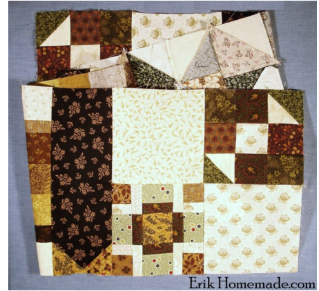
Row measures 12 1/2 by 60 1/2-inches

This step will begin the assembly of the center field of the 'Traditional Setting' quilt. We will offer the finishing steps broken down into sewing steps, much like the blocks, so that those who are working on the quilt as it posts may continue to follow along while continuing to finish their quilt. After all of the steps have finished posting for the 'Traditional Setting', the 'Non-Traditional' Setting will