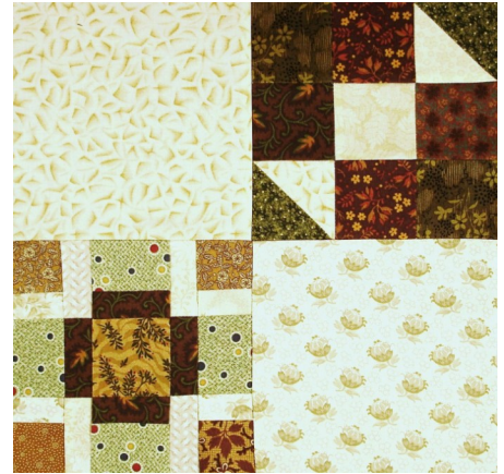
12 inch square finished (12 1/2-inch unfinished)

This step will continue the assembly for the Traditional Setting for finishing the quilt. We will offer the finishing steps broken down into sewing steps, much like the blocks, so that those who are working on the quilt as it posts may continue to follow along while continuing to finish their quilt. After all of the steps have finished posting for the 'Traditional Setting', the 'Non-Traditional' Setting will begin.