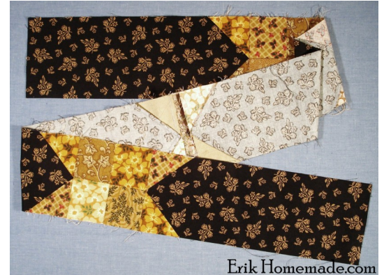
Row measures 4 1/2 by 60 1/2-inches

This step will continue the sashing for the Traditional Setting for finishing the quilt. We will offer the finishing steps broken down into sewing steps, much like the blocks, so that those who are working on the quilt as it posts may continue to follow along while continuing to finish their quilt. After all of the steps have finished posting for the 'Traditional Setting', the 'Non-Traditional' Setting will begin.