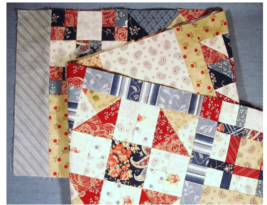
12 1/2 x 94 1/2-inches (row)

This step will continue the finishing of the Non-Traditional Setting for the quilt. We will offer the finishing steps broken down into sewing steps, much like the blocks, so that those who are working on the quilt as it posts may continue to follow along while continuing to finish their quilt. There are just a few steps left for this setting.