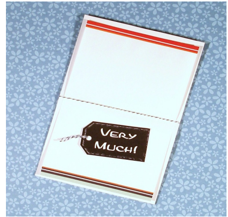
Inside of RED card