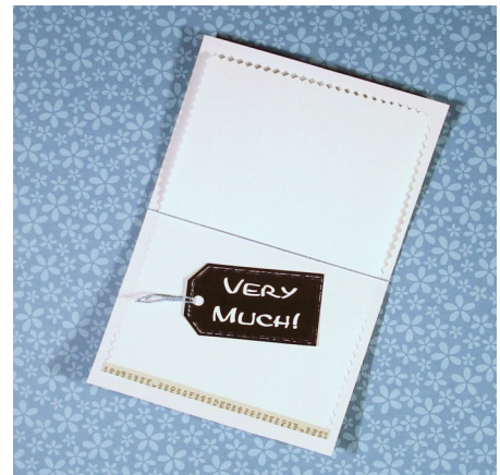
Inside of GREEN card